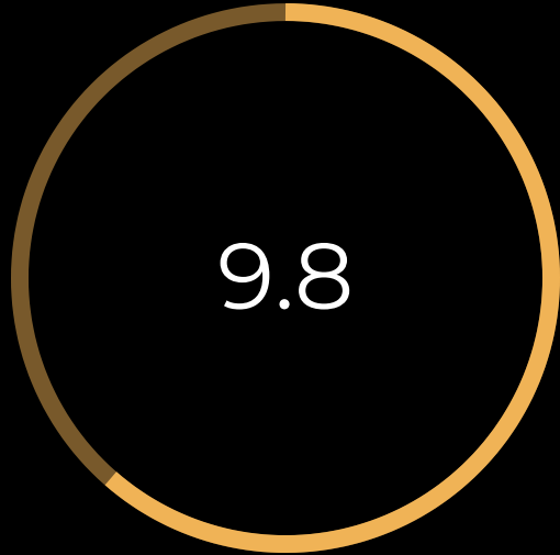
Big Give Back 2018

Total dollars raised at previous events (in thousands)