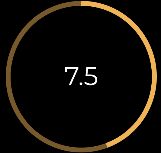
Toy Giveaway 2023